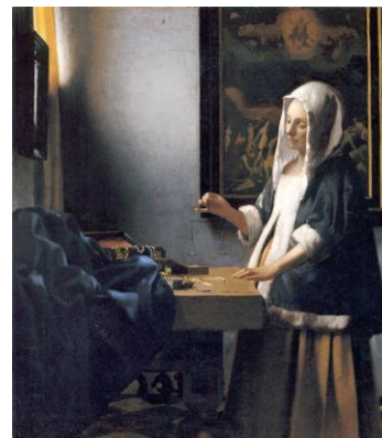
In Vermeer's Woman with a Scale , the focal point of the painting is accentuated with nothing more than a glance and delicate hand position.

When you look at works of art that you respond to, always ask yourself why. Keep those characteristics in mind as you develop your own pieces, too. That awareness is what drives the instruction that American Artist delivers. Whether it's a calendar featuring intriguing and unique works of art that make you think; DVDs such as Mastering Portrait Drawing , that delve into the details of how to draw a person's likeness; or magazines like Studios , where you get a peek into how to adapt your art space for performance and comfort, American Artist always couples artistic inspiration with instruction so that you can come away with a better sense of where to go on your own path as an artist.